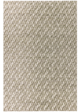
BH35281 Cozy Green