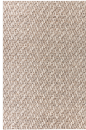
BH13341 Glazed Ginger