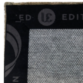
Anti-slip felt Lux finish